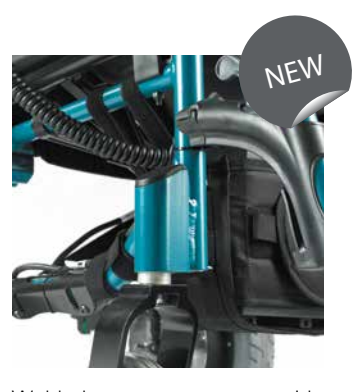
Welded castor mounts provide greater rigidity on the front of the chair.