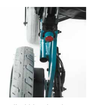
Overall width reduced The frames allow for the motors to sit inside and reduce the width.