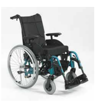
Self Propel Wheels (Option) Convert the chair to a manual chair.