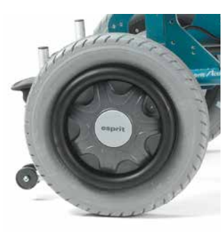
Wheel protection bumper