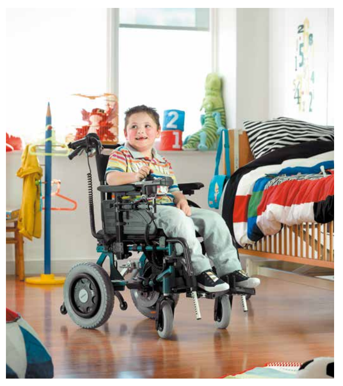
Junior Version Esprit Action<sup>4</sup><sub>NG</sub> is available in two different sizes : adult or junior version.

The Esprit Action <sup>4</sup><sub>NG</sub> has been designed in such a way to allow all the configurable options you would expect in a manual chair, but incorporating the powerful drive wheels discreetly into the hubs.