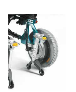
Alber anti-tippers as standard With Jack up function to help the guick release of wheels.

This allows an attendant to drive the wheelchair from behind in an easy yet intuitive manner.