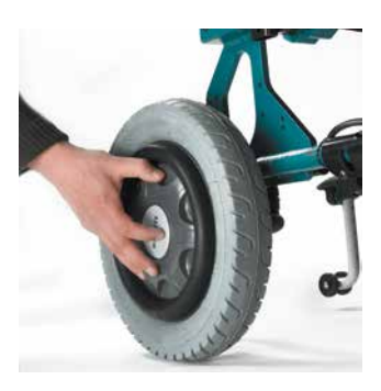
Simply push and turn to remove wheel.