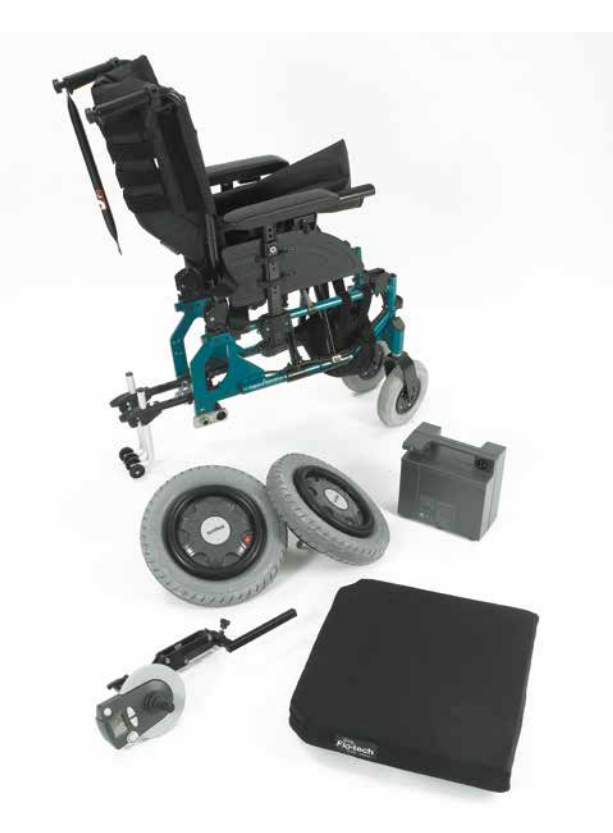
Disassembled and folded chair The heaviest part weighs only 15 kg (chassis).