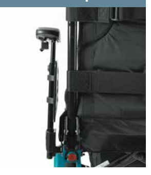
Adaptable arm widths gives up to 50mm adjustment.