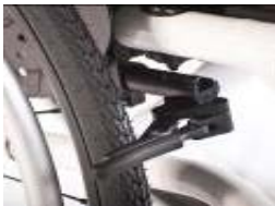
XFF060003 Compact brake