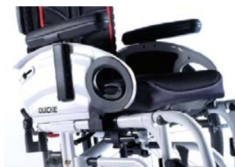
XFF04000x Desk sideguard, armrest, flip-up, removable