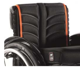
XFF 030317 EXO PRO backrest sling