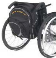
XFF090030 Back pack