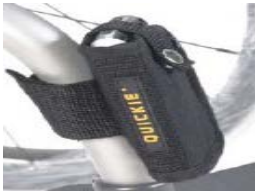
XFF090026 Mobile phone pocket