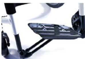
XFF050027 Footboard platform, lightweight, carbon fibre, auto folding