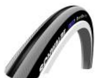
XFF070101 Schwalbe Right Run