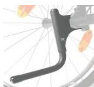
XFF090001 Tip assist