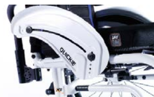
XFF040103 Aluminium, cold weather protection, fender