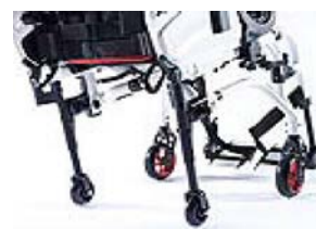
XFF090010 Transit wheels