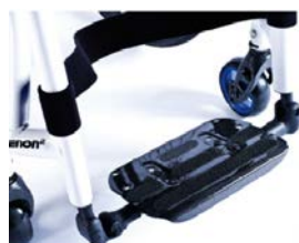
XFF050132 Footboard platform, lightweight, carbon fibre