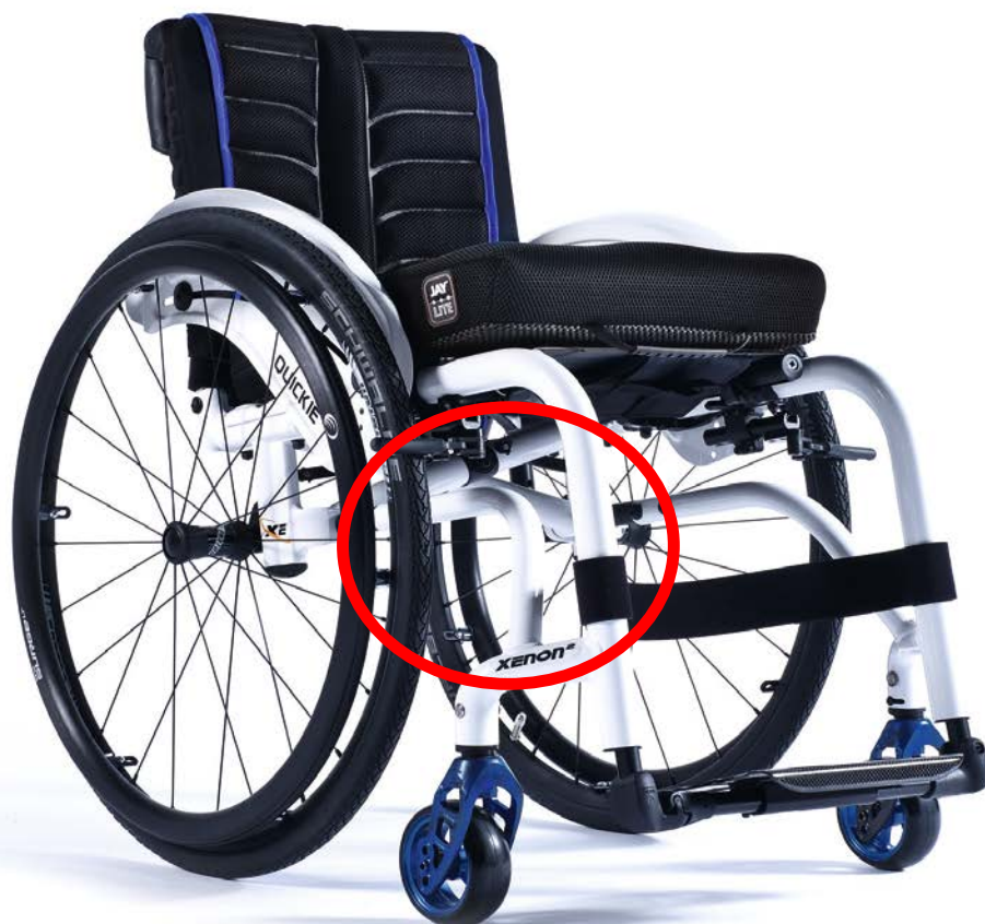
XFF090020 / 21 Hybrid frame