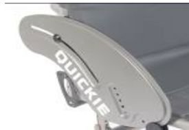
XFF040102 Aluminium, cold weather protection