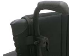
XFF 030204 Push handles, height-adjustable