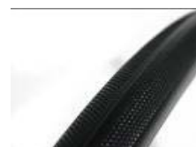
XFF070102 Tyre, puncture proof