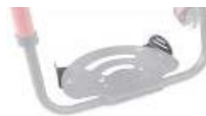
XFF050127 Adjustable side protection