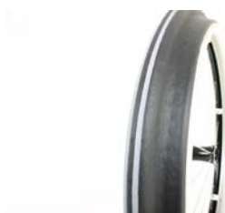
XFF070208 Handrims Maxgrepp