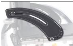
XFF040101 carbon fibre, cold weather protection, slim