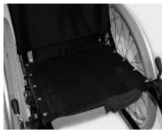
XFF 020002 Seat sling with 1 utility bag