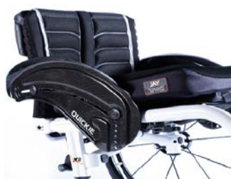
XFF040104 Carbon fibre, cold weather protection, fender