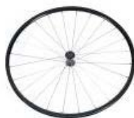
XFF070003 Lightweight wheel