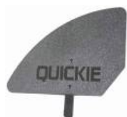
XFF040107 Composite sideguard detachable