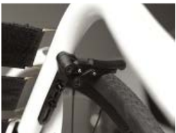
XFF060004 Lightweight compact brake