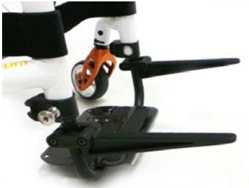
XFF090019 Caddy, flip-up bracket for bags