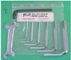
XFF090000 Tool kit