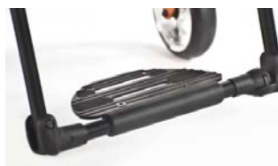
XFF050059 Footboard platform, performance