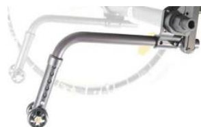
XFF090050 Anti-tip tubes, plug in, pair