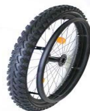
XFF07010 Mountainbike wheel