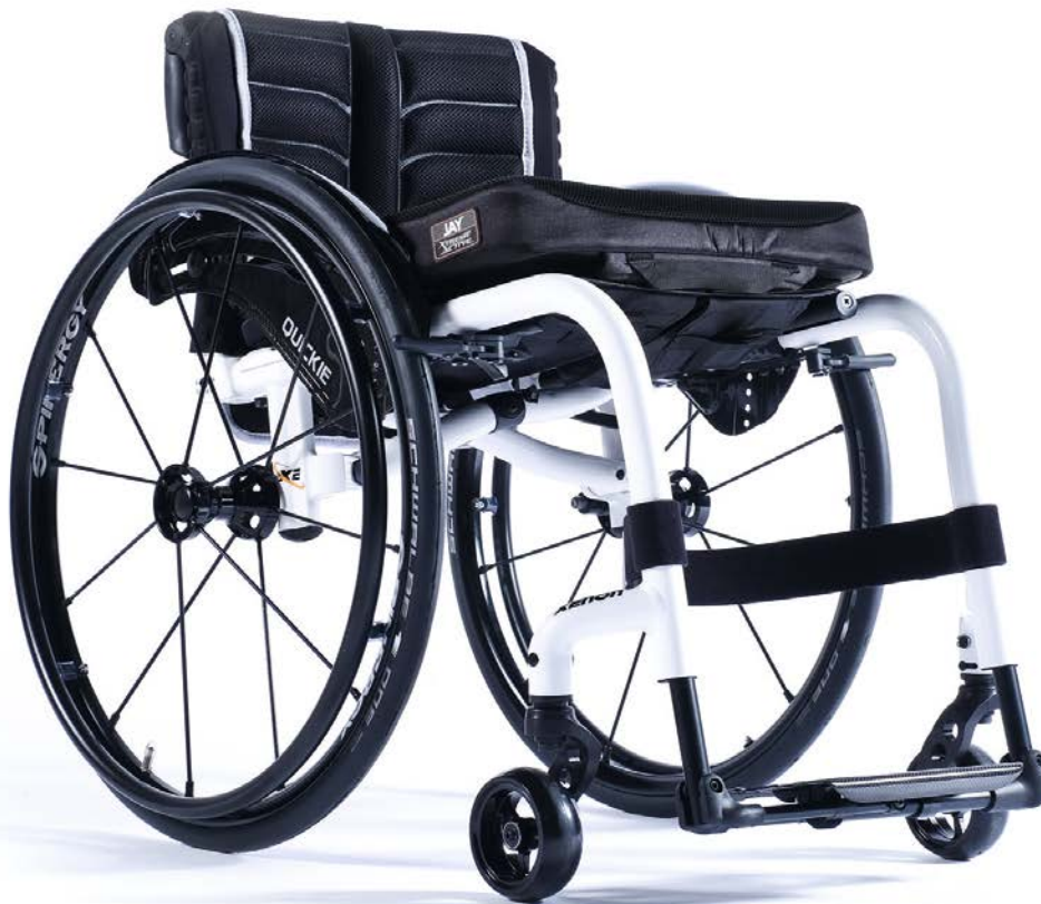
XFF010012 / 13 Open Frame