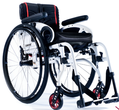
XENON² SA THE ALLROUNDER