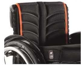
XES 030317 EXO PRO backrest sling