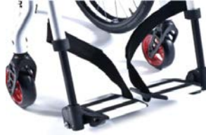
XES050022 Footboard divided, aluminium, frame colour