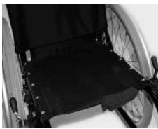
XES 020002 Seat sling with 1 utility bag