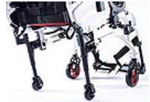
XES090010 Transit wheels