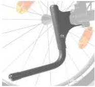
XES090001 Tip assist