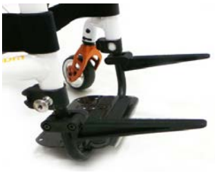
XES090019 Caddy, flip-up bracket for bags