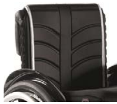
XES 030316 EXO backrest sling