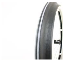
XES070208 Handrims Maxgrepp