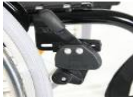
XES060002 Knee lever brake