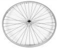
XES070002 Design wheel