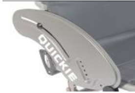
XES040102 Aluminium , cold weather protection