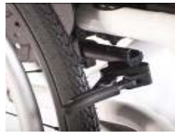
XES060003 Compact brake