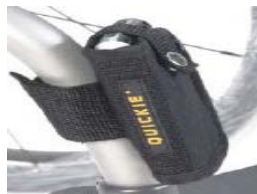
XES090026 Mobile phone pocket