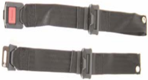
XES 090018 Lap belt with buckle, metal