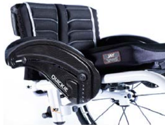
XES040104 Carbon fibre, cold weather protection, fender