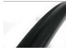
XES070102 Tyre, puncture proof