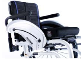
XES040117 Tubular armrest, swing away, removable, padded