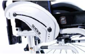
XES040103 Aluminium, cold weather protection, fender