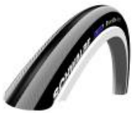
XES070101 Schwalbe Right Run