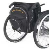
XES090030 Back pack