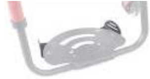
XES050127 Adjustable side protection