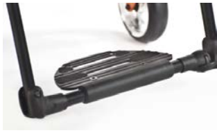
XES050059 Footboard platform, performance