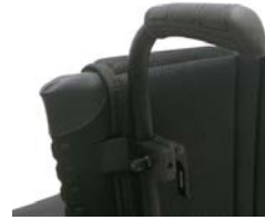
XES 030204 Push handles, height-adjustable