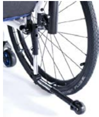
XES090004 Anti-tip tubes, swing away