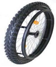
XES070010 Mountainbike wheel