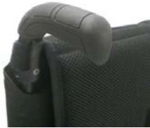
XES 030201 Push handles long