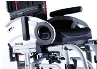
XES04000x Desk sideguard, armpad, flip-up, removable