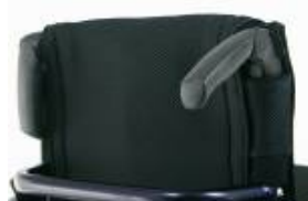
XES 030203 Push handles, fold-down