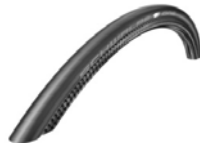
XES070107 Schwalbe One