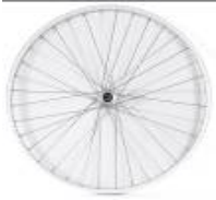
XES070001 Universal wheel