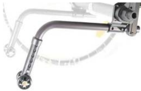
XES090050 Anti-tip tubes, plug in, pair