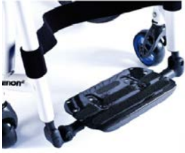
XES050132 Footboard platform, lightweight, carbon fibre