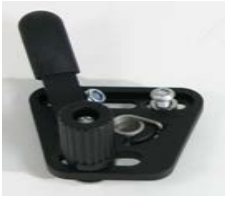
XES060001 Standard brake