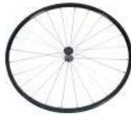
XES070003 Lightweight wheel