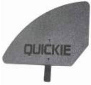
XES040107 Composite sideguard detachable