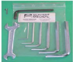
XES090000 Tool kit