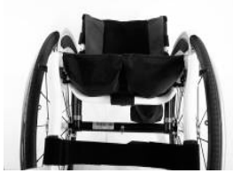
XES 020003 Seat sling with utility bags 2