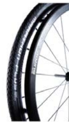
XES070211 Handrims Surge®