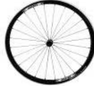
XES070004 Proton wheel