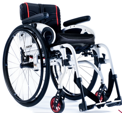
XENON² SA THE ALLROUNDER