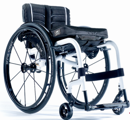
XENON² FF THE LIGHTEST