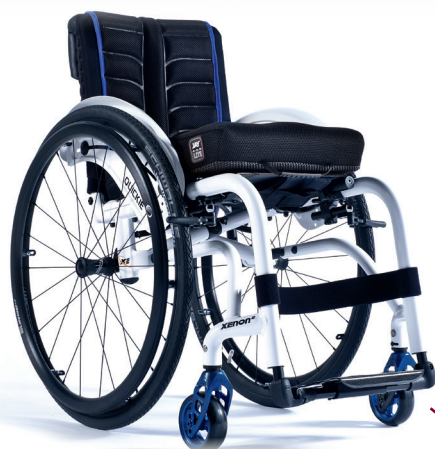
XENON² H (HYBRID) THE STRONGEST