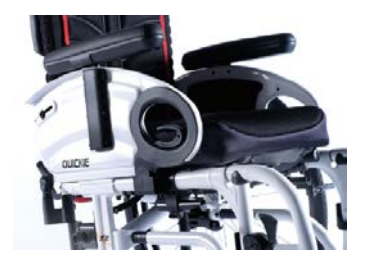
XES04000x Desk sideguard, armpad, flip-up, removable