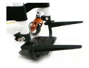
XES090019 Caddy, flip-up bracket for bags