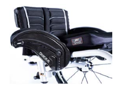
XES040104 Carbon fibre, cold weather protection, fender