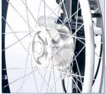
Drum brake (option).