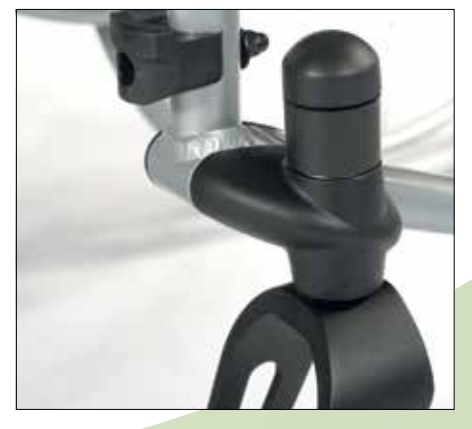
A new robust castor attachment offers more rigidity and an improved appearance.