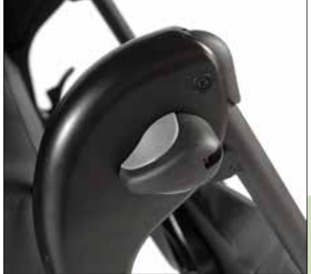
New and improved elevating legrest for increased functionality and improved appearance.