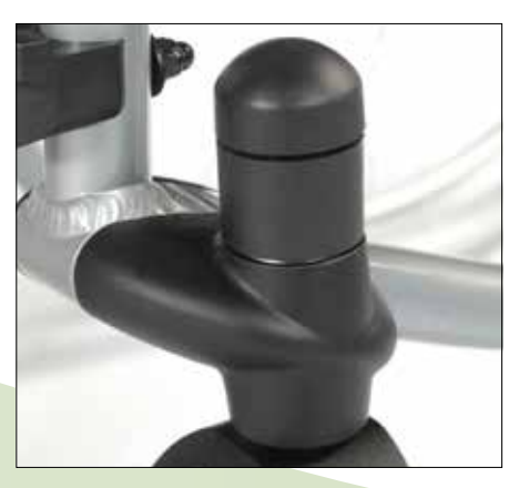
New robust castor attachment offers more rigidity and an improved appearance.