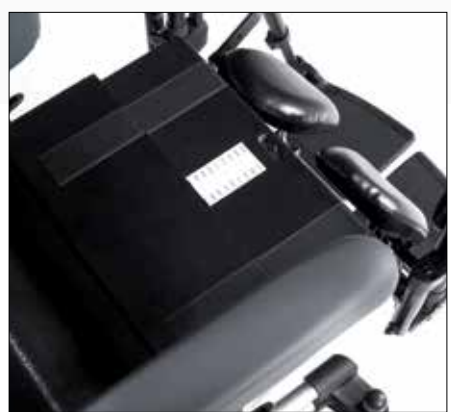
Seat depth adjustable from 42 – 50cm.