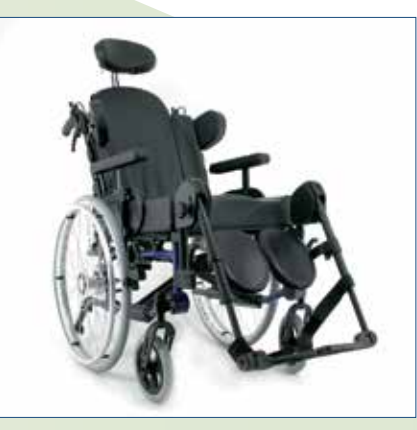
Comfort seat and reclining back (option) for increased sitting tolerance.