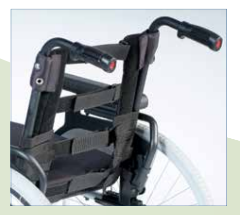
Tension adjustable four strap backrest extendable from 41 - 46cm.