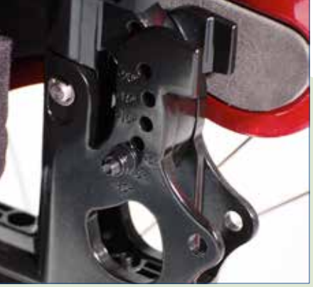
Angle adjustable back to match active and semi-active user requirements (option).