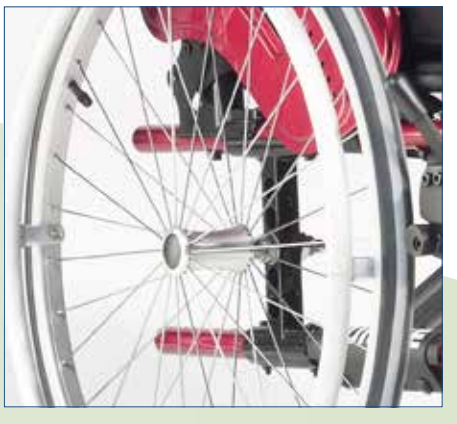
Choice of lightweight stylish wheels, castors and tyres for the more active user.