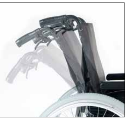
Reclining back (30° infinite adjustable)