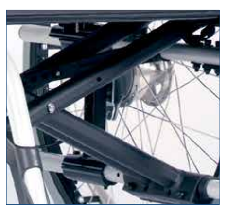
Robust reliable four arm cross brace.