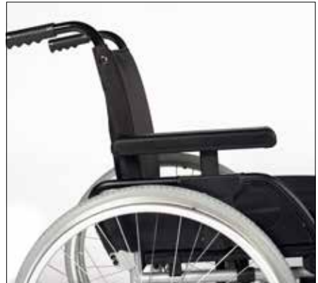
Height adjustable armrest with sliding pad for long and short position