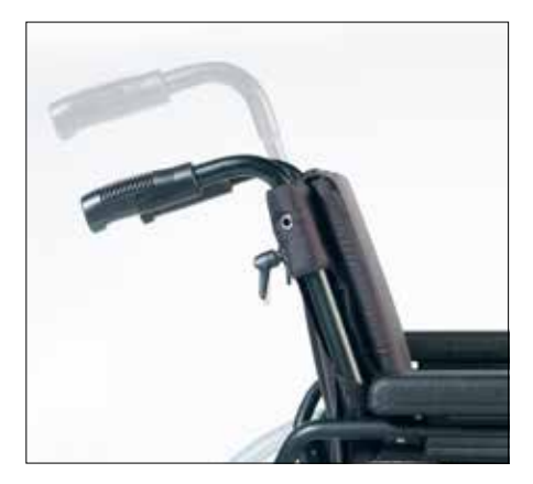
Height adjustable push handles

The X Family<sup>2</sup> comes with a wide range of options, settings and adjustments.