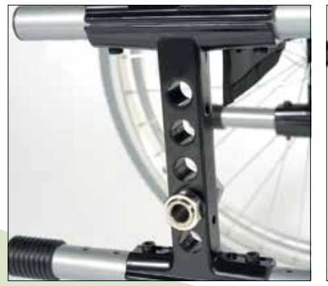
New improved frame offers more seat depth adjustment (41 - 46cm).