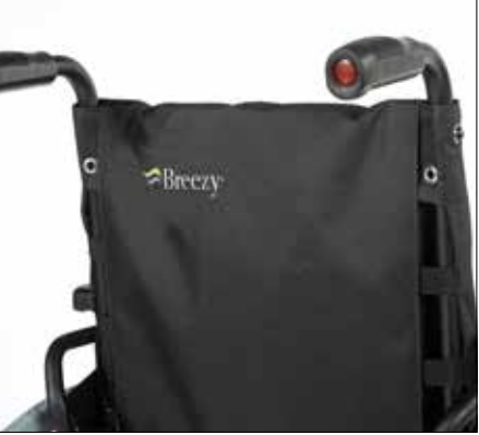
The tension adjustable backrest is now extendable from 41 - 46cm.