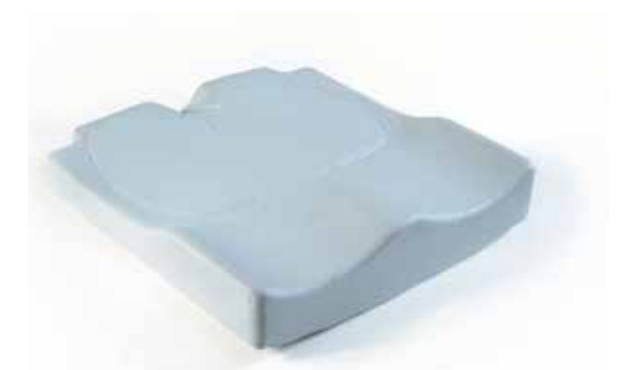
The JAY Easy Visco is a lightweight cushion with high level comfort and stability.

The JAY Soft Combi P cushion is designed for the client who has symmetrical posture and low risk of skin breakdown needing minimum to moderate postural support.