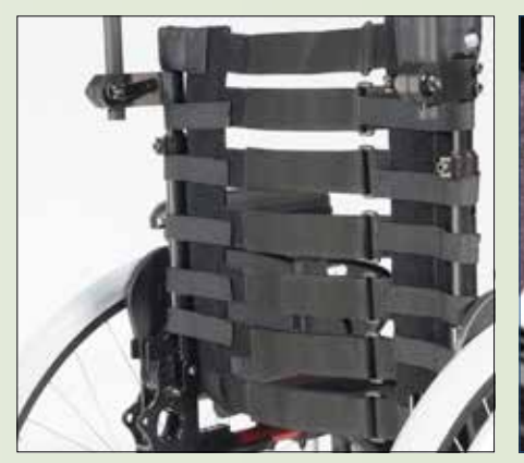
Tension adjustable back sling and back height adjustment (35 - 50cm) for optimal active ergonomics and comfort.