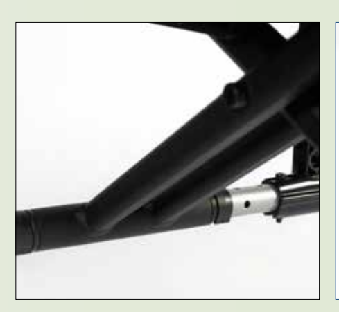
New robust three arm cross brace.