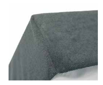
Cover helps to prevent a build up of shear and friction forces against the user

Cover is two-way stretch, waterresistant and vapour-permeable. Cover features an anti-slip base.