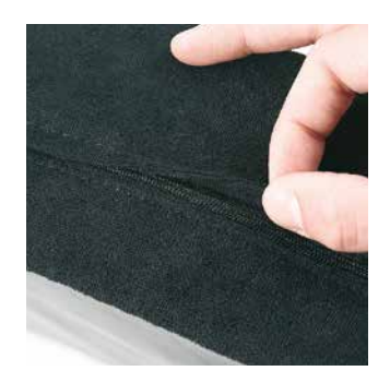
Full length flap conceals the

(410 \times 410, 430 \times 430 \text{ and } 460) x 410 mm). (See size chart for details).