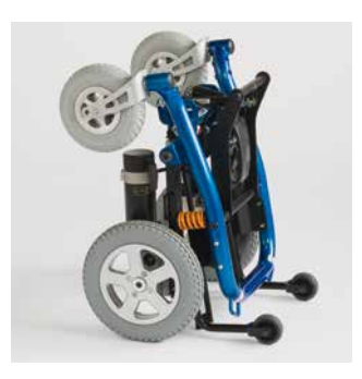
Swing out anti tippers A useful feature for storing the wheelbase.