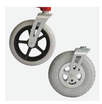
Different applications Choice of two castor sizes depending on customer requirements.