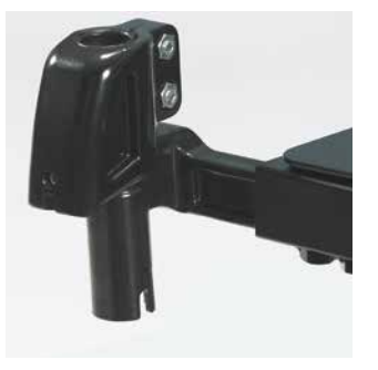
Leg Rests Sideways adjustable leg rests for optimal individual positioning and comfort.

The telescopic seat frame offers complete flexibility with adjustable widths 380mm to 530mm (15" to 21"), as do the Flex3 back plates. A range of cushions and backrests that can be changed at any time ensures optimal comfort for the client.