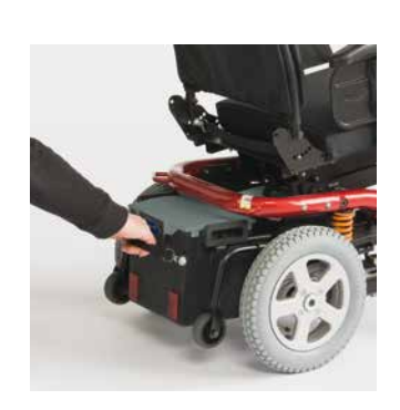
Removable batteries Separate cable free battery boxes slide in and out without any effort. Option for AGM or Gel batteries.