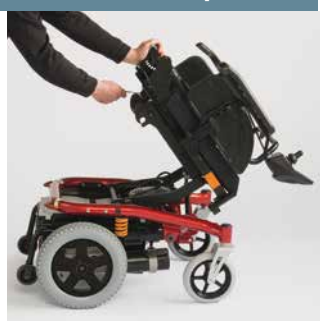
Removable seat unit Pull a strap, lift the seat and disconnect the remote cable in order to take the seat off. It couldn't be easier!