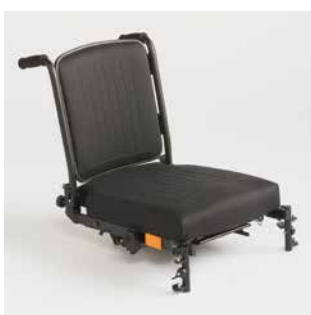
Firm seat unit Padded robust seating. Cross compatible with the well known Spectra Plus seat.