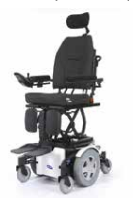
Seat lifter The 300mm seat lifter provides easy access to higher obstacles.