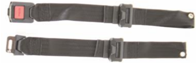
Lap belt with buckle, metal