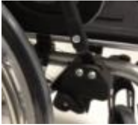
One arm wheel lock