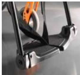
Divided footplate composite