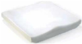
Jay Basic (picture shown without upholstery)