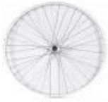
Universal cross spoked