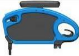
Desk armrest, fixed height, short armpad(25cm)