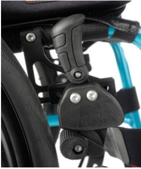
Knee lever wheel lock