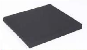
Seat cushion, cover with zipper, black