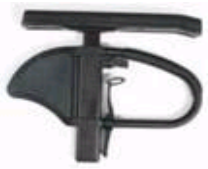
Single post height adjustable armrest