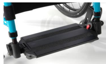
Platform, angle and depth adjustable; flip up, aluminium with locking system