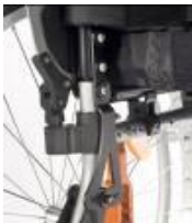
Angle adjustable back -12° to 12°