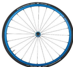
Lightweight wheel, anodized blue