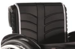
EXO backrest sling