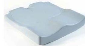
Jay Easy Visco (picture shown without upholstery)