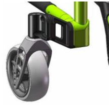
Expansion kit, designed for hemiplegic users