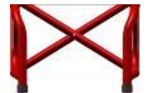
Frame FF 85° (integrated footrest), inset (20 mm on each side), active