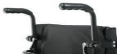
Height adjustable push handles