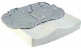
Jay Easy Fluid (picture shown without upholstery)