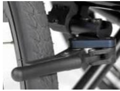
Compact wheel lock