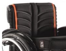
EXO PRO backrest sling