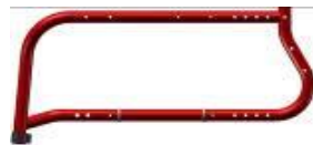
Life FF 85°