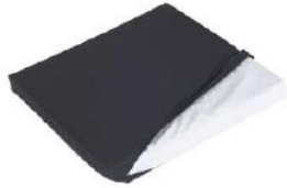
Seat cushion, climate membrane water-resistant, cover with zipper, black