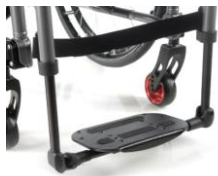
Platform footplate lightweight angle & depth adjustable composite flip up