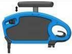
Desk armrest, height adjustable, short armpad(25cm)