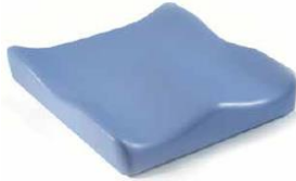
Jay Soft Combi P (picture shown without upholstery)