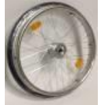
Drum brake wheel