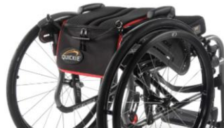
Backrest, fold down (to the front)