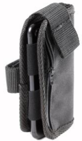
Mobile phone pocket