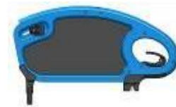
Desk armrest without armpad