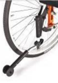
Anti-tip swing away