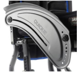
Sideguard alu with fender