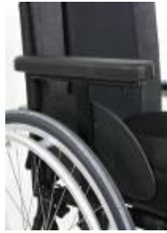
Single-post sideguard, depth adjustable, tool height-adjustable