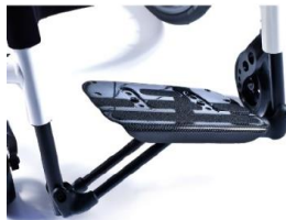
Footboard platform, lightweight, carbon fibre, auto folding