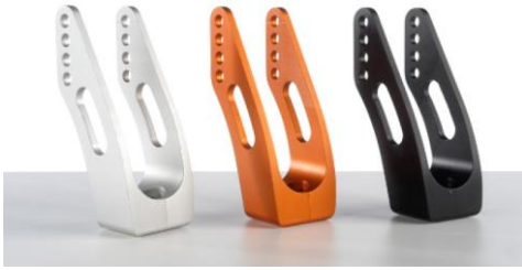
Fork Aluminium, black, orange & silver