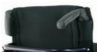
Fold down push