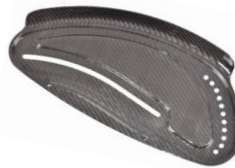
Sideguard carbon with fender