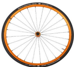
Lightweight wheel, anodized orange