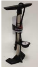
High pressure pump