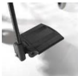
Divided footplate aluminum