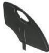
Sideguard composite detachable