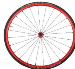
Lightweight wheel, anodized red