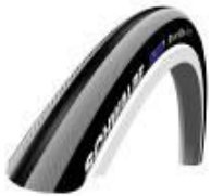
Right Run Tyre