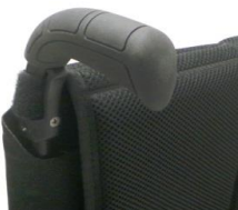
Push handles long