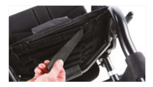
Block-and-Tackle Seat Upholstery

Mounted on both castor arms and with 3 modes (high, low and blink), the integrated LEDs will light-up your night. The power pack provides up-to 4 hours of run time and can be easily detached for recharging or to save you 110g weight. How's that for bright?